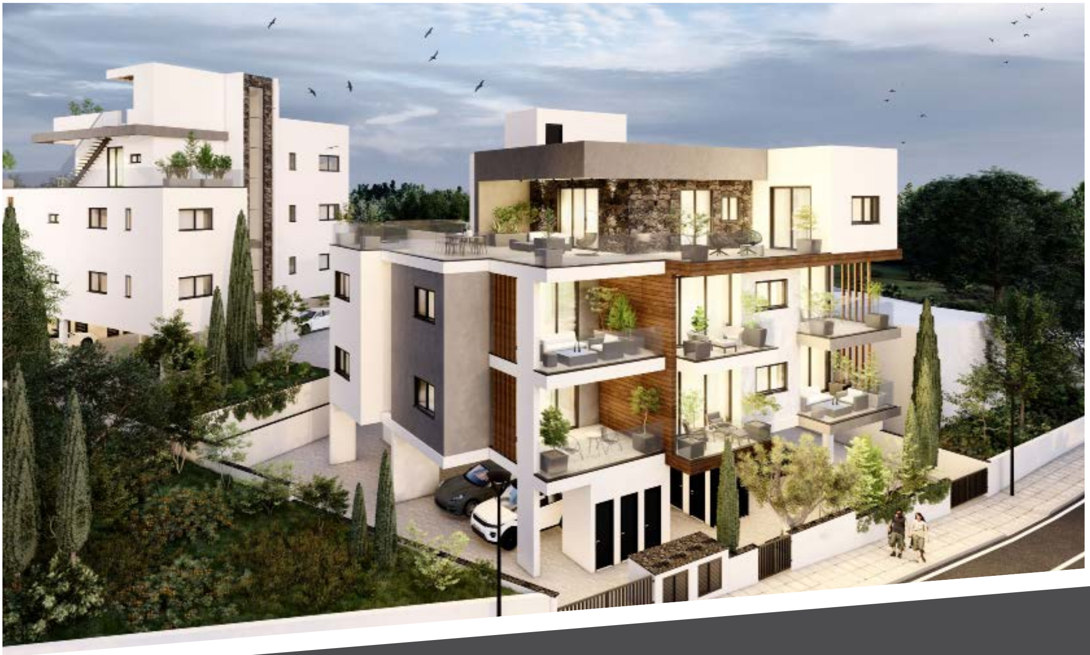
PARAKKLISIA – LIMASSOL UNDER-CONSTRUCTION