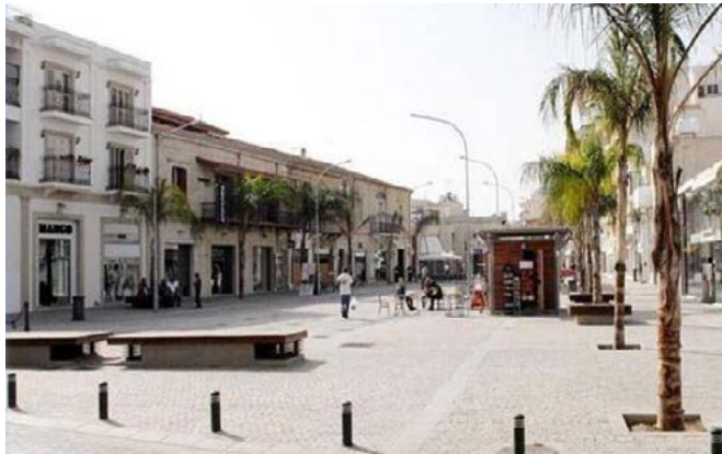
4 MINUTES FROM ERMOU STREET