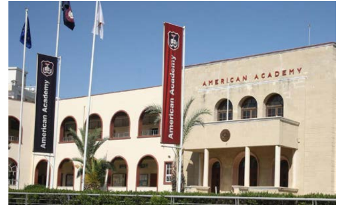
2 MINUTES FROM AMERICAN ACADEMY