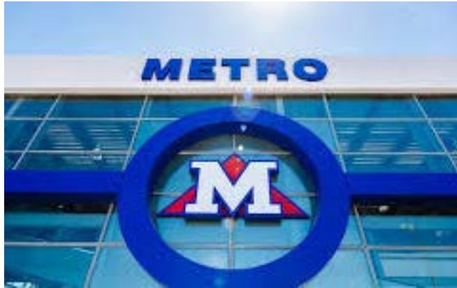
FACING METRO SUPERMARKET