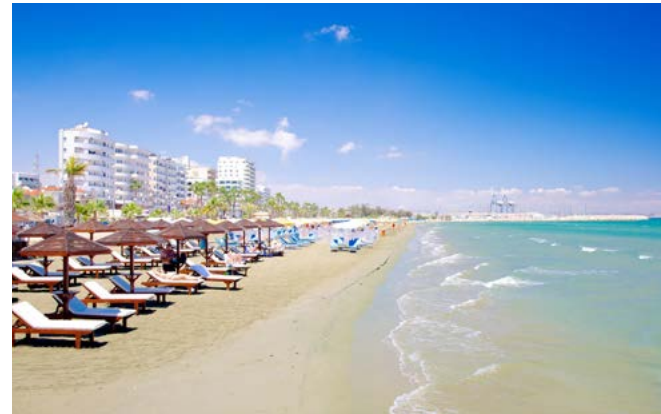
5 MINUTES FROM FINIKOUDES BEACH