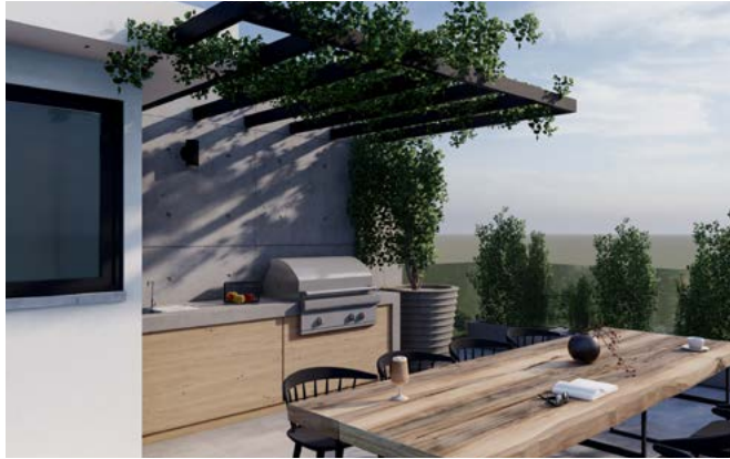
PENTHOUSE WITH LARGE TERRACE