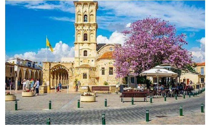
PRIME & LUXURIOUS AREA