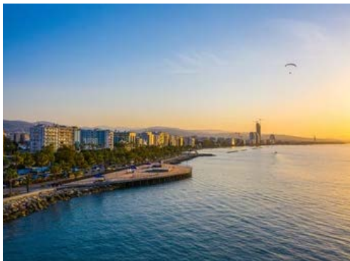
AMAZING VIEWS OVERLOOKING LIMASSOL COAST