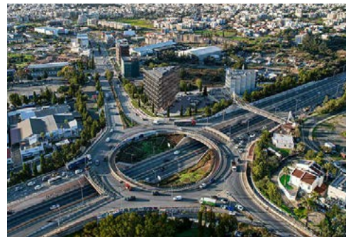
STRATEGIC LOCATION 2 MINS FROM THE HIGHWAY