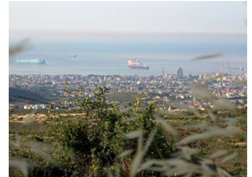
PRIME & LUXURIOUS AREA