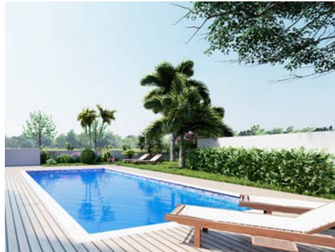
COMMON SWIMMING POOL