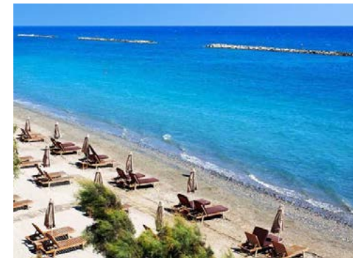
NEARBY LOCAL AMENITIES