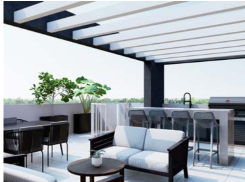
PENTHOUSES WITH LARGE ROOF TERRACES