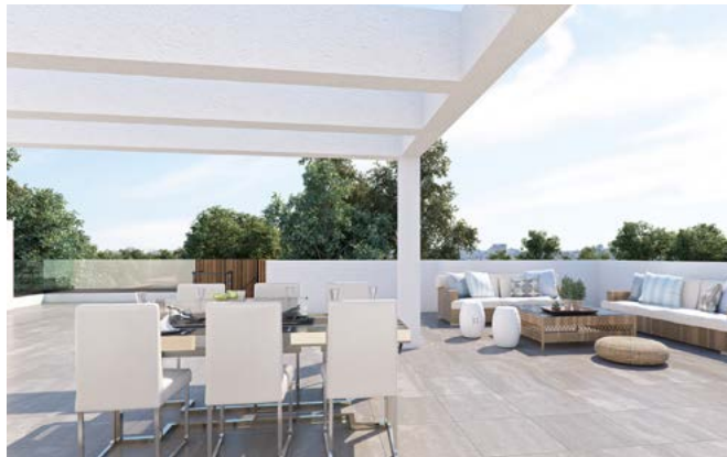
PENTHOUSES WITH ROOF TERRACES