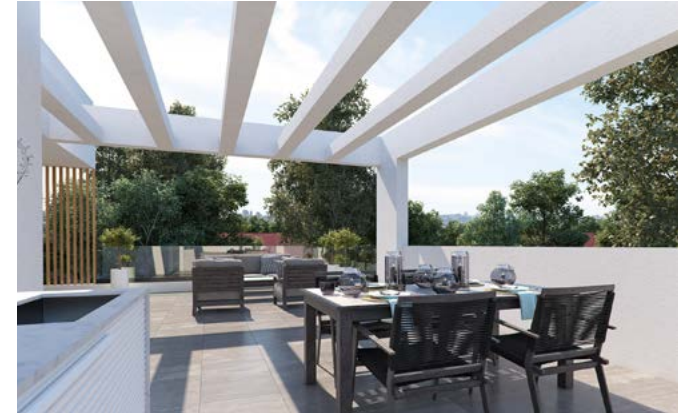
APARTMENTS WITH PRIVATE GARDENS