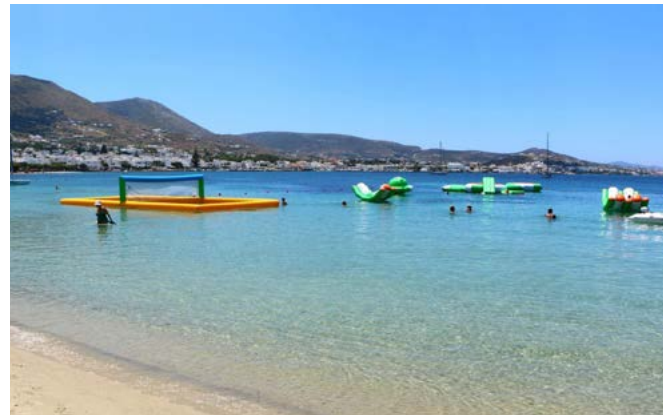
2 MINUTES FROM THE BEACH