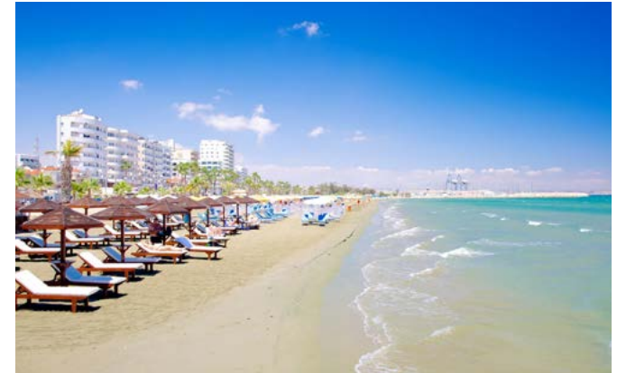
6 MINUTES FROM FINIKOUES BEACH