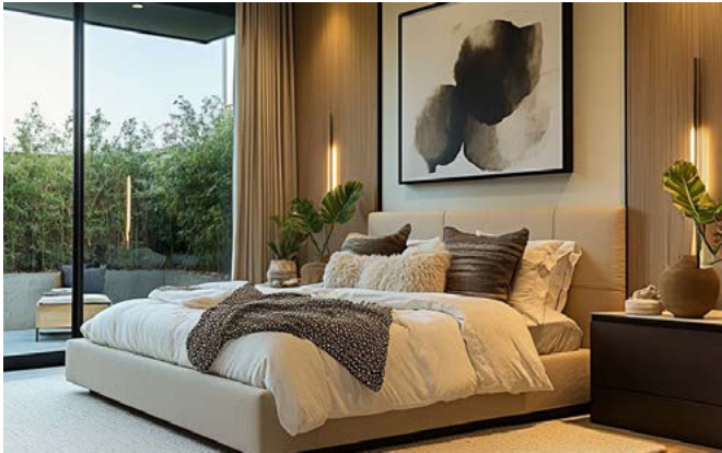
3 BEDROOM APARTMENTS