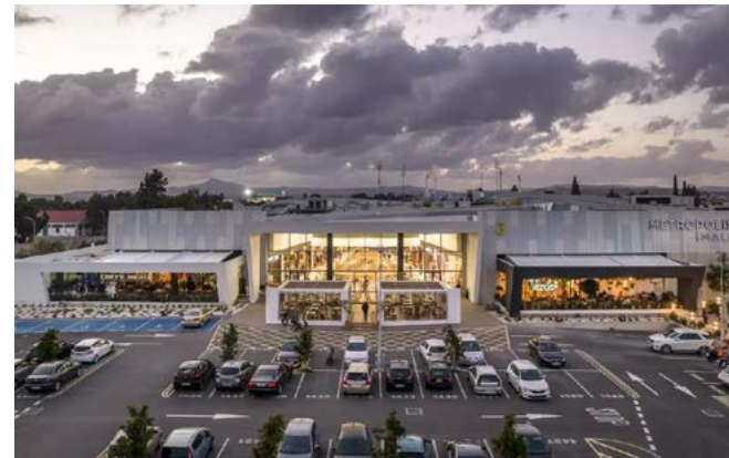
8 MINUTES FROM METROPOLIS MALL