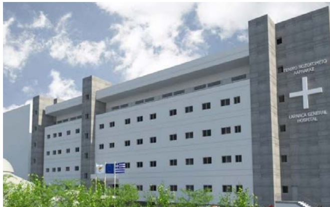
7 MINUTES FROM LARNACA GENERAL HOSPITAL