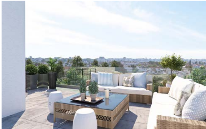
PENTHOUSE WITH LARGE ROOF TERRACE