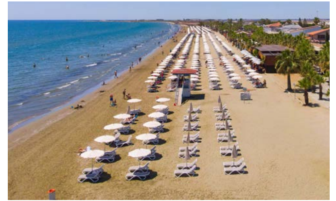
2 MINUTES FROM MACKENZIE BEACH