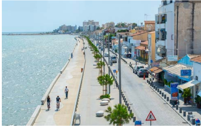
LOCATED IN THE BEST TOURISTIC AREA IN LARNACA