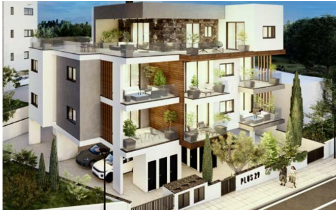
2 BLOCKS OF 3 FLOORS EACH