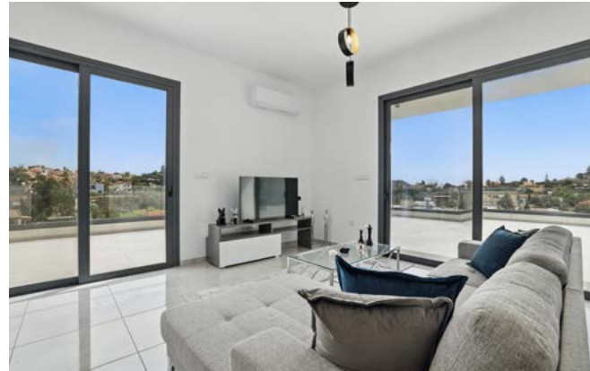
PENTHOUSE APARTMENT WITH ROOF GARDEN