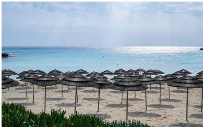
6 MINUTES FROM THE BEACH