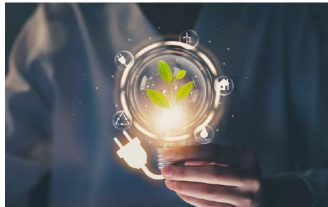
ENERGY EFFICIENCY CATEGORY: A