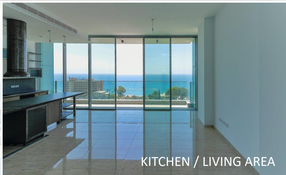
KITCHEN / LIVING AREA