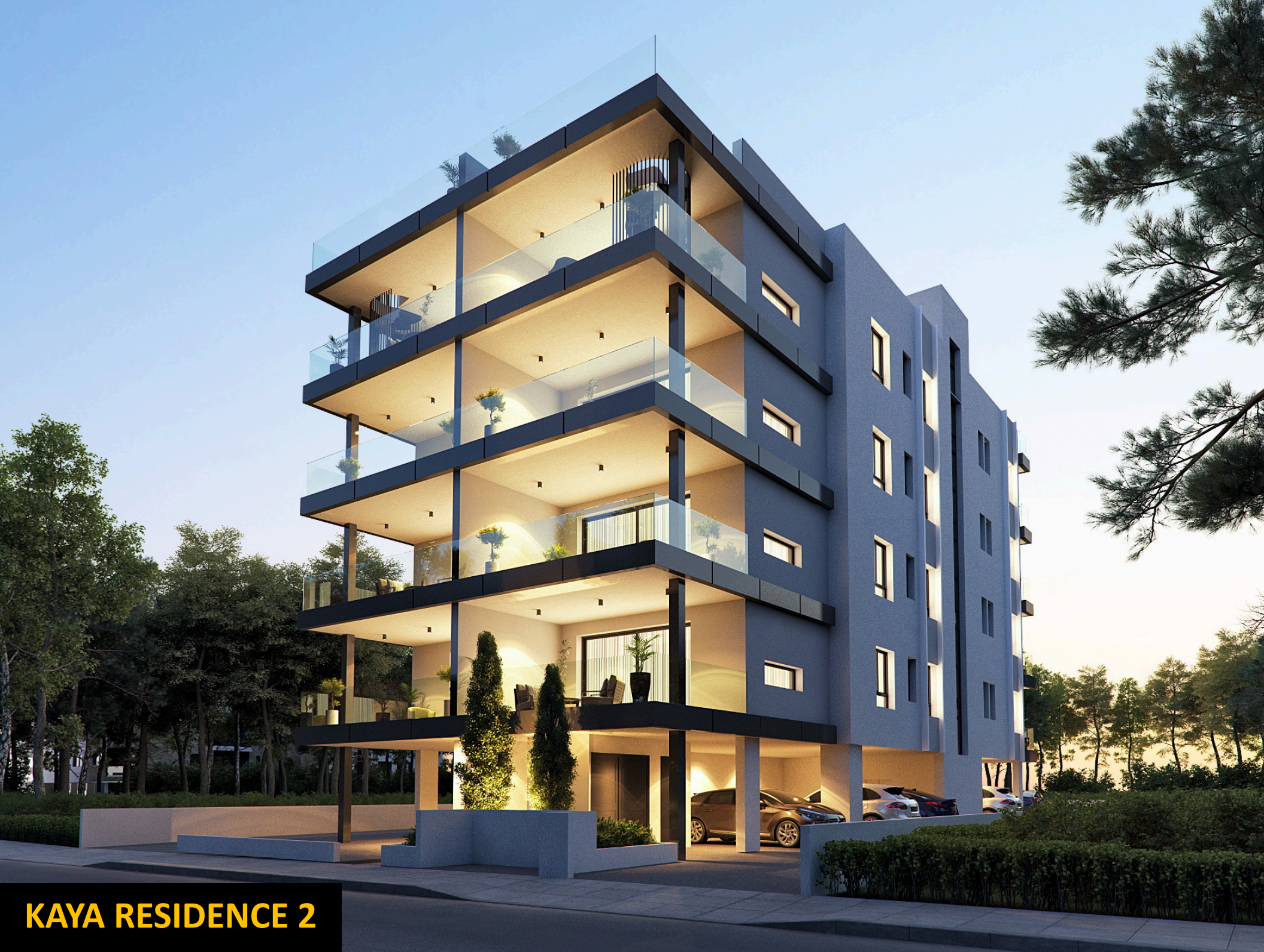
KAYA RESIDENCE 2