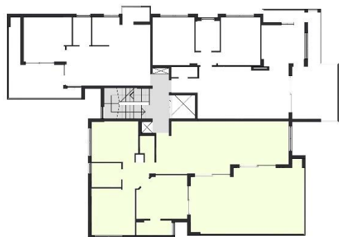
Apartment on floor plan