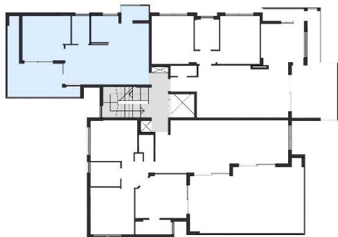
Apartment on floor plan