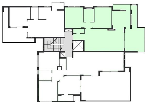
Apartment on floor plan